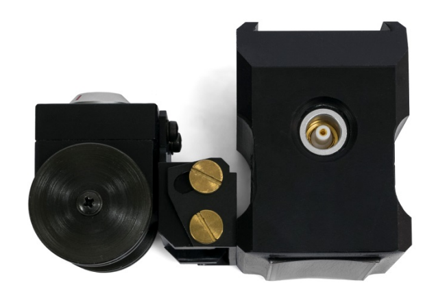
Flat Surface and scanning along the tubular surface